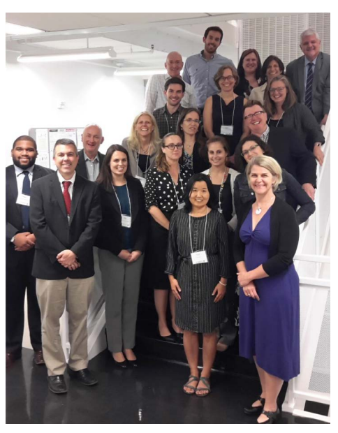
The Consortium, September 2015.