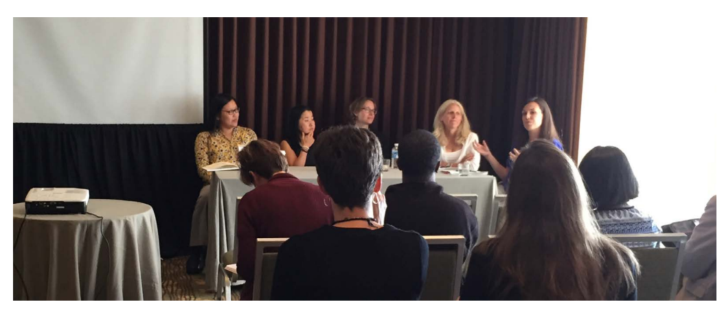
Roundtable discussion at the NAWRS Annual Workshop in Atlanta, Georgia, August 2015.

use of opportunistic experiments—randomized controlled trials that study the effects of an initiative, program change, or policy action that an agency or program plans or intends to implement, as opposed to one designed specifically for a research study.